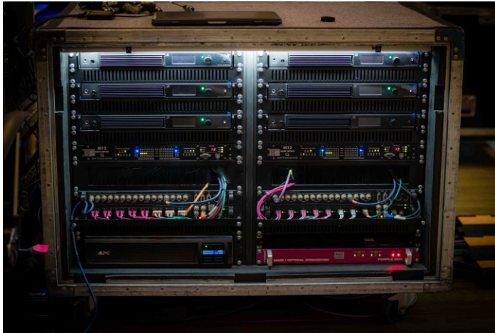
Six rack-mounted Spectera Base Station were on duty in the sound room, four were active, one used for scanning, No. 6 was a spare

“The requirement of ORF was nicely simple and short: ‘We need coverage in the entire venue.’,” recalled Schmitt. “We started out with two Spectera DAD antennas at stage right and green room left for each Base Station, and that gave us full transmit and receive power for the hall. For extra reliability, we then added another two antennas per Base Station. Also, a firmware variant especially for the event had given us a preview of upcoming functionalities that were needed on site, such as a level recorder.” An RF control center in the sound room continuously provided a full overview of the current status of the Spectera wireless microphones and in-ears using Spectera WebUI and the Sonoros app.