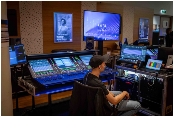
Failsafe operation was key at the ESC – one of two independent monitor consoles