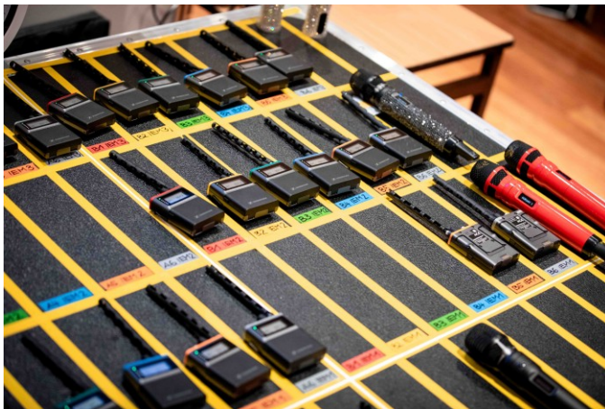
Spectera bodypacks and handhelds ready for the next act

Highlighting the dimensions of the show, Næsby pointed out that “No other TV production builds in more redundancy than the Eurovision Song Contest. Almost the entire set-up has a full backup system ready to take over. Really, the only two things, where a dual set-up doesn’t work, are the artist, and the microphone in their hand, making it the single most important piece of equipment in the signal chain. The Spectera handheld SKM quickly proved to be the perfect solution. The unmatched RF stability of wideband transmission, combined with multi-antenna capabilities instantly provided confidence to the production that ORF had made the right choice of bringing these pre-production samples to a show of this calibre.”